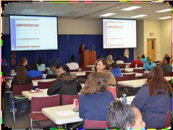
COTO Labor Market Workshop

ADHE/CPI and CPI Campuses Provide Many Program Activities & Strategies for Students and CPI Staff